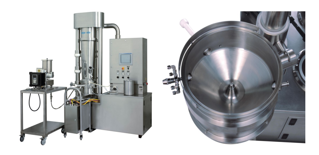
Vector Corporation Granurex GXR-35